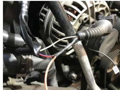
Step 7 Pull 12V key hot power from this solenoid.