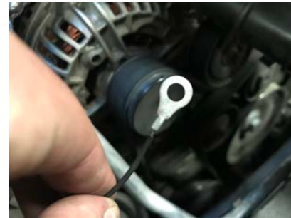
Step 8 Add included eyelet to ground wire and ground to the first runner.