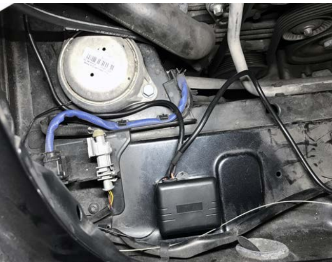
Step 9 Mount control unit as seen below on drivers side area of the vehicle.