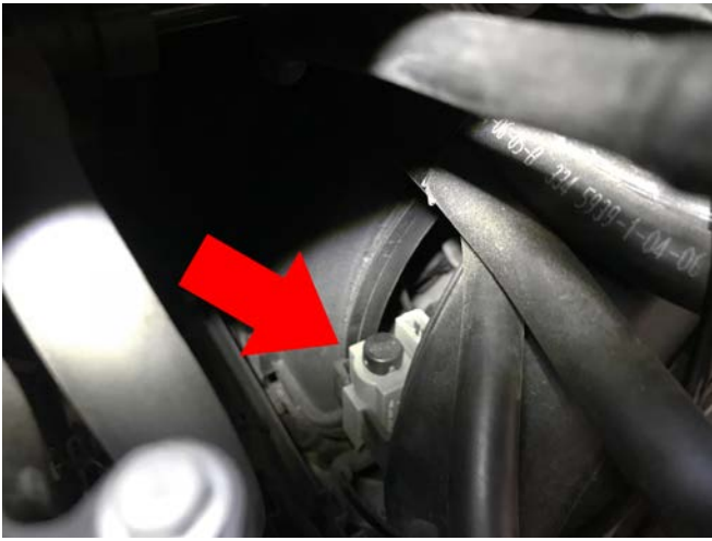
Step 6 Located solenoid between between driver side intake runners