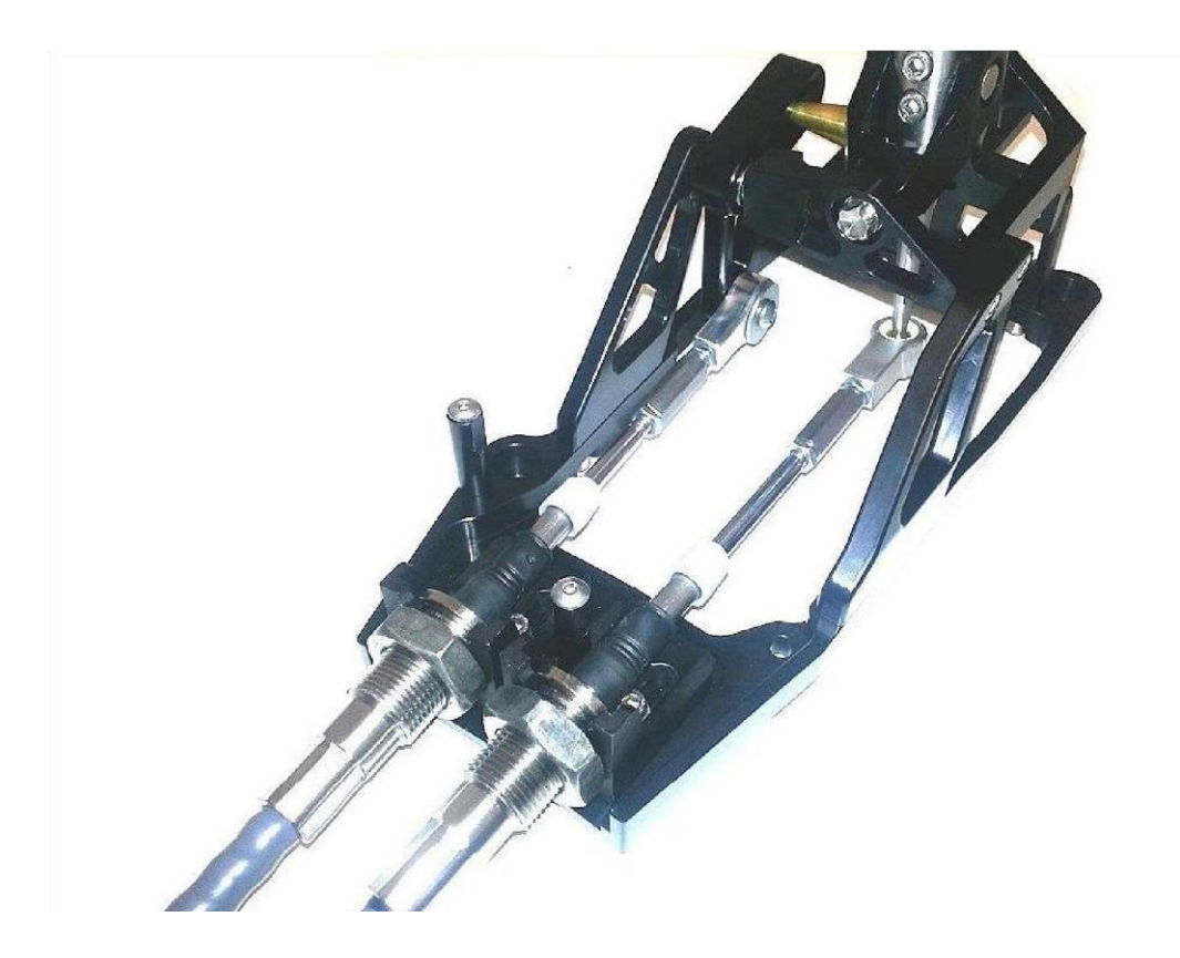
When installing the cables components make sure to apply the plastic caps to all ball end mounts.