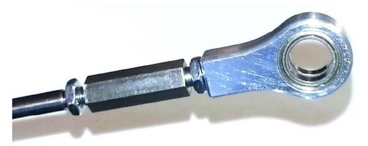
Adjustment will move shift lever position. Be sure to have it's in the desired position before securing.