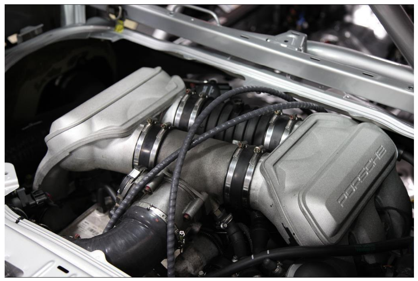
Correctly routed and connected.