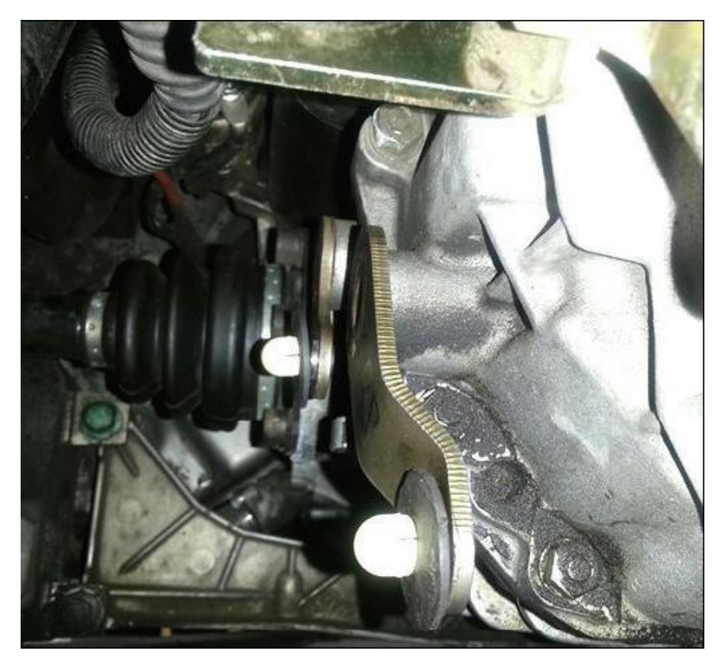
This transmission picture view indicates the yellow plastic inserts applied on the transmission cable posts before rod end fitment.