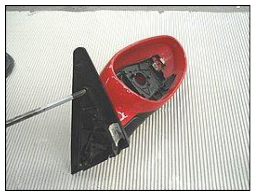
Undo the screws and remove the housing from the arm.