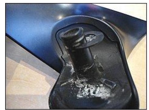
Remove the spring. The disassembly is complete.