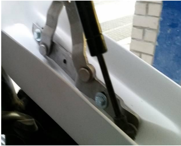
Step 8. Fix the joints for the trunklid lifter on the hardtop and the trunk lid